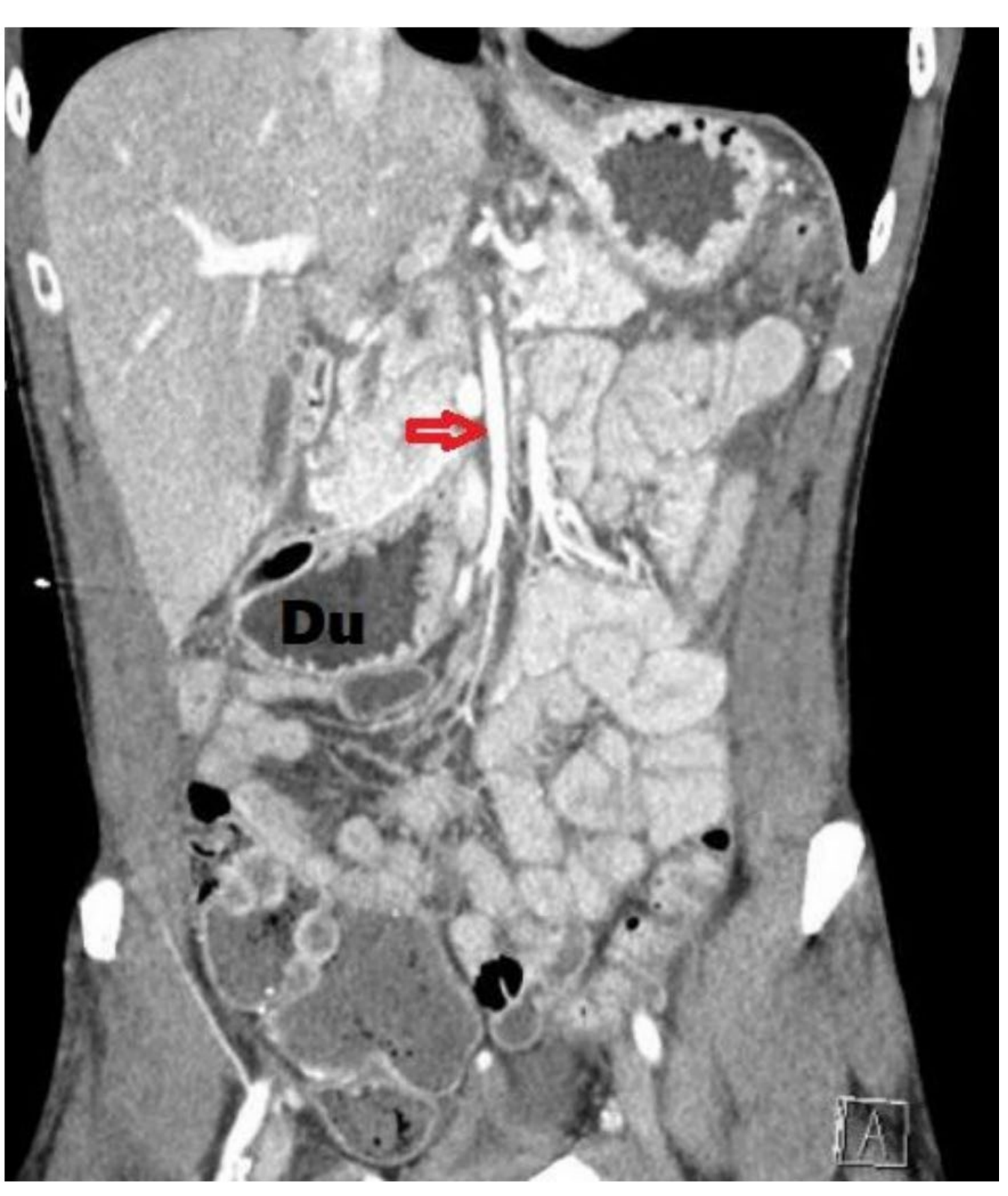
Fig 2. Contrast-enhanced coronal CT image showing distension of the duodenum (Du) with its abrupt narrowing as it passes under SMA (arrow).

Fig 1. Contrast-enhanced CT images on initial presentation demonstrating findings consistent with acute pancreatitis with peripancreatic edema (a) in the setting of SMAS (b).