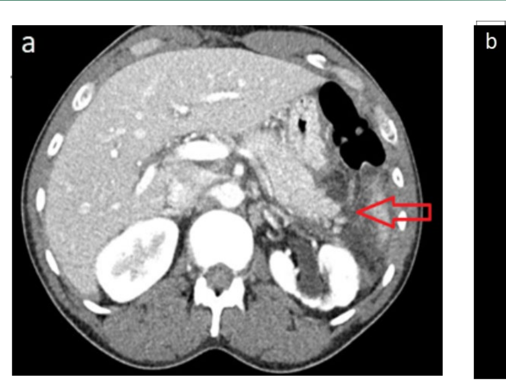
Fig 1. Contrast-enhanced CT images on initial presentation demonstrating findings consistent with acute pancreatitis with peripancreatic edema (a) in the setting of SMAS (b).